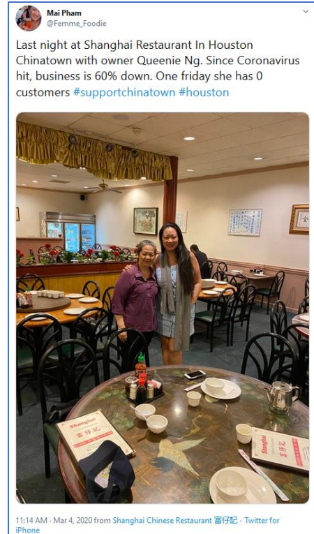
Figure 5: Chinese restaurants seeing business decline.

Impacts from COVID-19 are being felt across a number of industries, some more extensively than others, and are expected to increase as international supply chain effects are felt and the public reacts to the spread of infection. The severity of transportation impacts will depend on the abilities of manufacturers to maintain inventories, government agencies to manage exposure, and the workforce to adapt to rapidly and sometimes drastically changing conditions during the coming weeks. The public and private sectors are working together to provide current information, including steps to reduce effects, improve resilience, and speed recovery, which could come as soon as April or May.