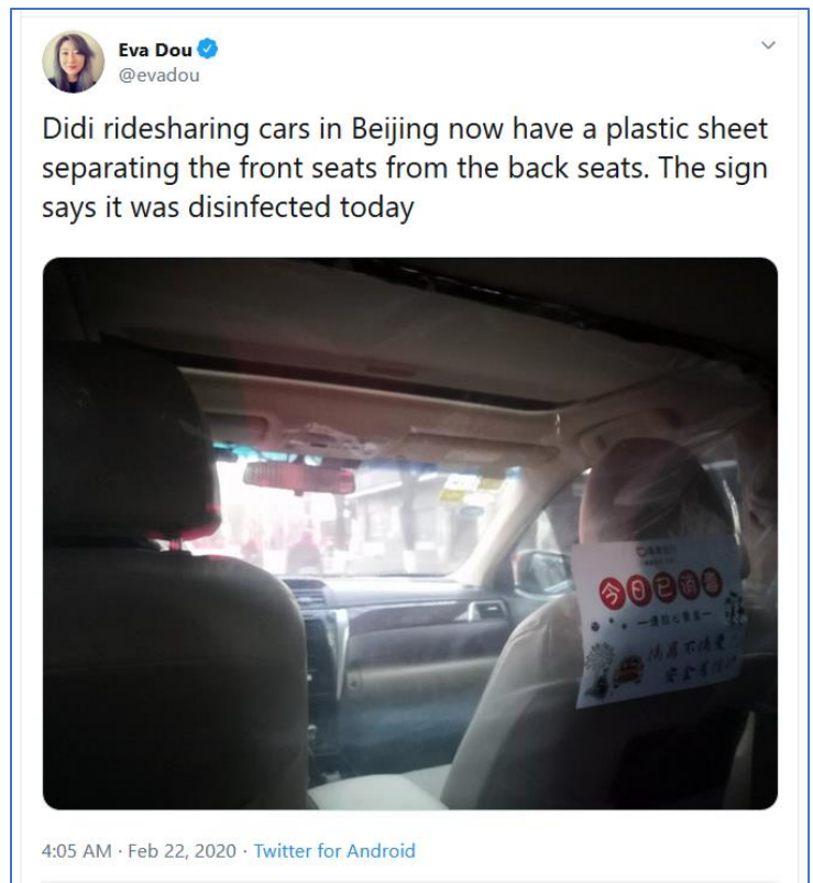
Figure 3: Plastic Separates TNC Driver and Passengers.

The ride-hailing industry, generally referred to as transportation network companies (TNCs), are noting concern. Uber has acknowledged that COVID-19 poses a material risk to the business 46 and has reduced the number of airport pickups. 47 Lyft provides sanitizers at driver service locations and airport queues. Two Uber drivers in Mexico unknowingly transported an infected passenger; Uber suspended 240 passengers who may have been subsequently exposed. 48 While there are anecdotal reports about taxi and TNC drivers avoiding airports, 49 taking extraordinary precautions (Figure 3), or being selective about passengers, 50 and ridership declines in foreign countries, 51 there are no domestic ridership numbers available publicly to gauge possible impacts. Lyft, which only operates in North America, sees risks from COVID-19 primarily as threatening the supply chains for scooter and bike-sharing and believes it is benefiting from people now choosing Lyft over public transit. 52